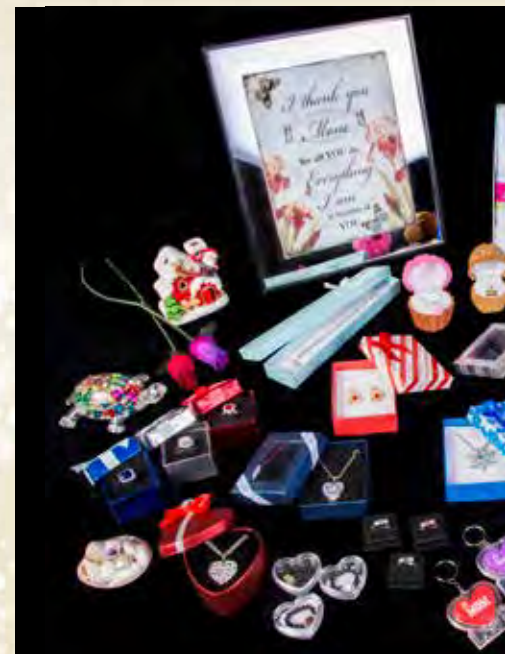
GIFTS FOR: MOMS •

Offering your students the best selection of gifts, including Offering children the opportunity to experience the