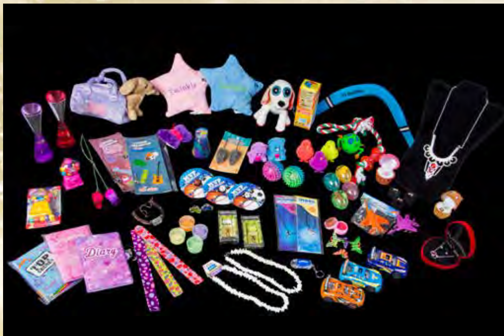
GIFTS FOR: KIDS • FRIENDS • PETS