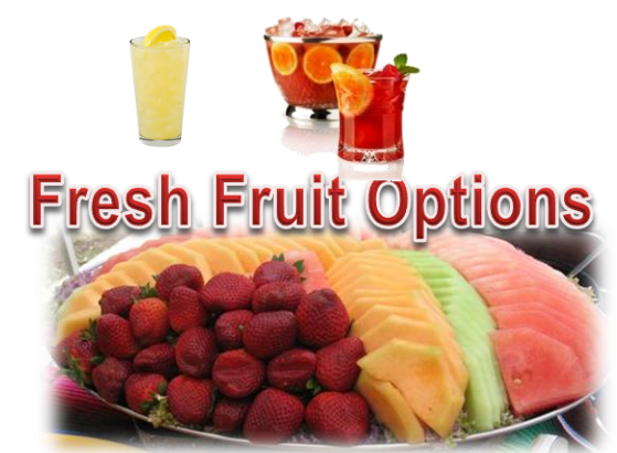
Fresh Fruit Chunks Of Melons, Grapes and Berries – Add $3.25 Per

Fresh Fruit Platters Served Sliced - Add $3.95 Per • Served with the Main Buffet